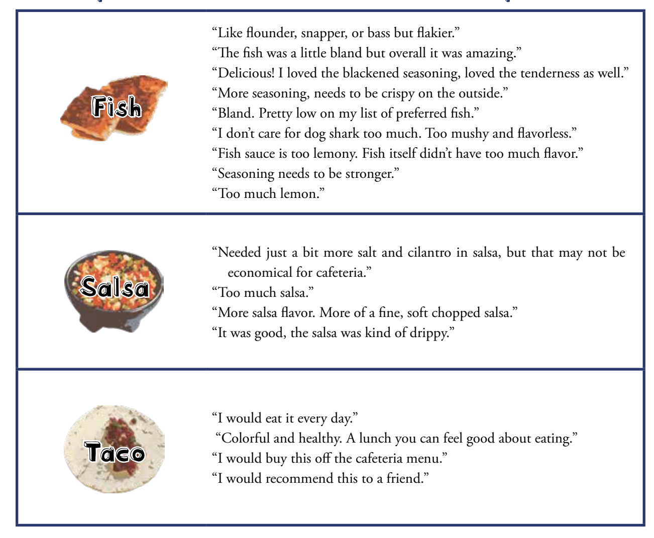
TABLE 2. Comments made by students and staff about the cape shark tacos and individual components