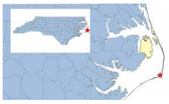
Cape Hatteras Secondary School is located on Hatteras Island on the Outer Banks of North Carolina.

about 66 million pounds of 77 commercial fish species or groups of closely related species (NCDMF, 2016). Dare County had more seafood landings than any other county in North Carolina in 2015, with fishermen landing more than 18 million pounds of seafood (NCDMF, 2016). Hatteras Island in Dare County, where CHSS is located, was one of the most active seafood ports in the state, with fishermen landing more than 5 million pounds in 2015.