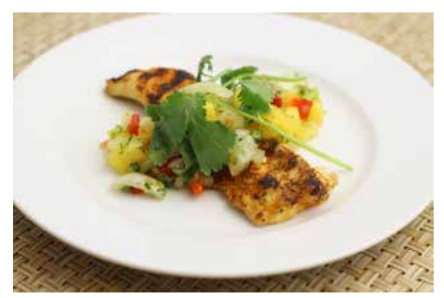
North Carolina Sea Grant tested different preparations, such as chargrilled blackened cape shark fillet over pineapple salsa, to better understand consumer preferences.

If more consumers become aware of cape shark and find it an appealing seafood choice, demand might grow and prices may rise as a result. Currently, fishermen get little for the fish. In recent years, North Carolina wholesalers, also known as fish houses, have purchased cape shark for $0.11 to $0.22 per pound (Aiken, 2016). They then sell it almost exclusively to processors in New Bedford, Massachusetts, at roughly