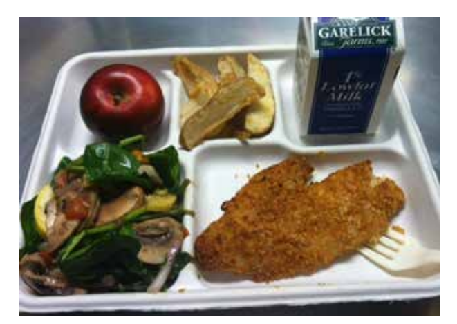
North Coast Seafoods sells Baked Sole New England Style in 3.6- and 4.5-ounce portions.

School in Seabrook, New Hampshire, purchases its seafood directly through several local suppliers, such as the Yankee Fisherman's Cooperative based in Seabrook Harbor. The cooperative was founded in 1990 and comprises over 60 members who are ground — cod, pollock, haddock and flounder — fishermen, lobstermen, tuna fishermen and northern shrimpers (FINE, 2016b).