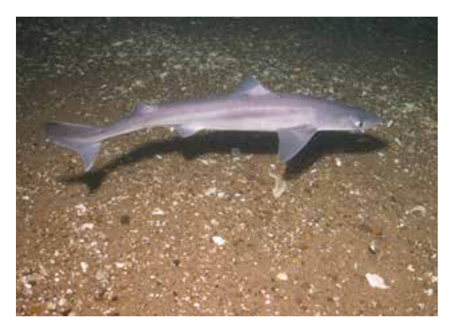
Cape shark, also known as spiny dogfish, is considered an undervalued commercial species in North Carolina.

North Carolina consumers do not eat cape shark because of a lack of consumer recognition. Consumption of lesser-known species like cape shark could support the regional fishing industry as more popular finfish become inconsistently available due to harvest restrictions.