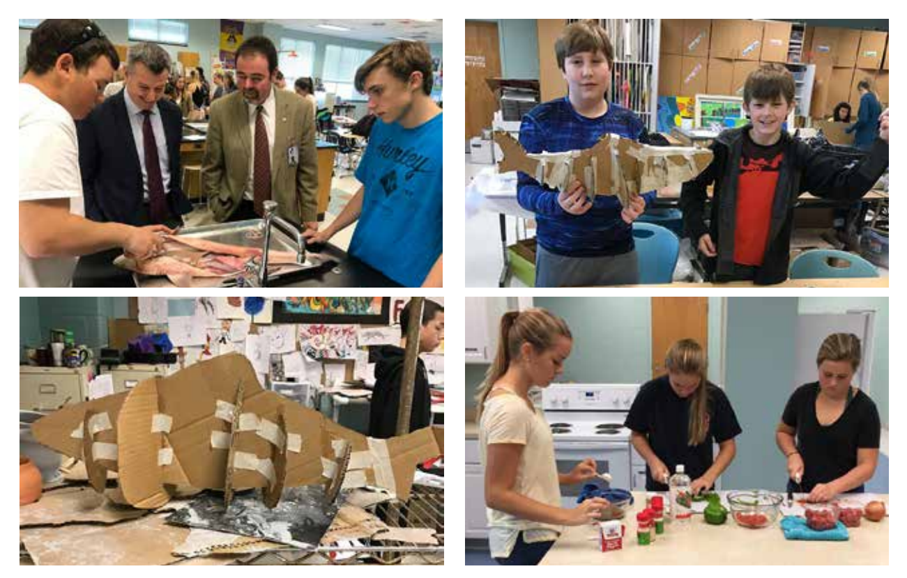
Clockwise from top left: Biology students dissected cape shark. • Art students created cape shark sculptures. • The students developed a homemade blackening seasoning, as well as a mild salsa for the taco recipe. • The art sculptures were showcased around the school.