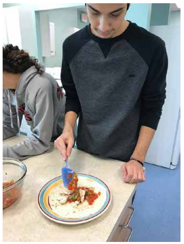
A foods student assembles a cape shark taco for testing.

Respondents also could elect to write comments about individual components and the overall tacos ( Table 2 ). About 17 percent of the respondents left comments about the fish, while approximately 7 percent left comments about the salsa and the overall taco. The 10 comments about the fish ranged from negative to positive. Some respondents found the fish bland and recommended additional seasoning. The four comments about the salsa were negative. All four comments about the overall tacos were positive.