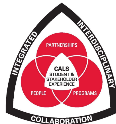
Figure 2: CALS Strategic Orientation

At Citizenship NC Focus, 4-Hers from across the state gather annually to exchange ideas, gain knowledge and learn through hands-on experiences about the importance of being an active and engaged citizen. Through various conference sessions and facilitated discussions, delegates learn and share