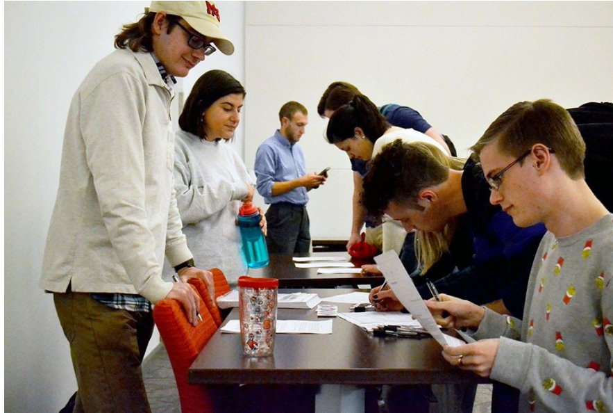
Students at the Voting Jamboree in Talley Student Union hosted by the student government learn about the candidates in their voting districts on Monday.